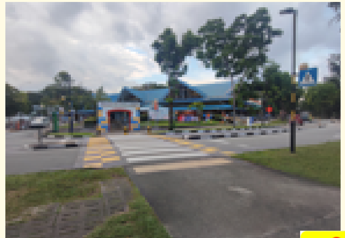
Along West Coast Drive