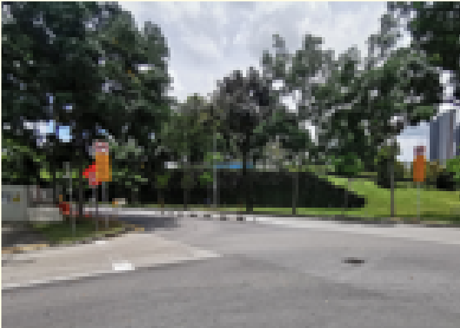
West Coast Drive