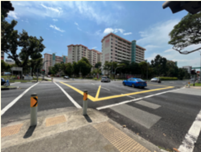
Junction of Clementi West Street 2/ West Coast Road/Clementi Avenue 2